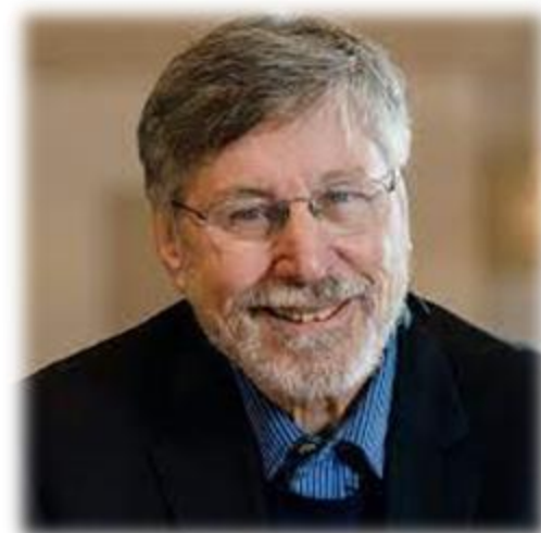
Bessel Van der Kolk Author - The Body Keeps The Score

“Neuroscience research shows that the only way we can change the way we feel is by becoming aware of our inner experience and learning to befriend what is going inside ourselves.”