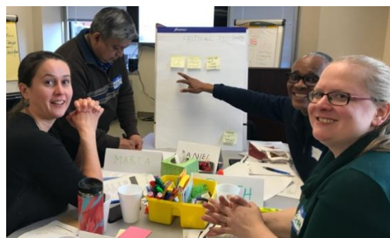
NIATx Change Leader Academy participants, Illinois

The Great Lakes MHTTC provides training and technical assistance in a unique model of process improvement called “NIATx” which assists behavioral health organizations to identify and address problems in their work processes, speed up and sustain the adoption of evidence-based practices and reduce barriers to access to and retention in treatment. The service is typically delivered through a one-day Change Leader Academy (CLA) with ongoing coaching provided. During Year One, five Change Leader Academies were held in five different states in our region with 111 individuals trained.