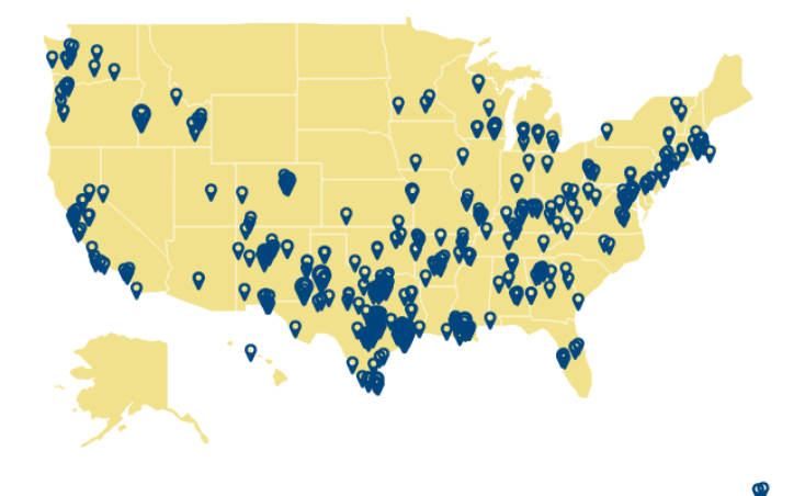
Figure 1. Work Location of Conference Participants

There were a variety of professionals represented in the attendees. The majority of participants identified as a counselor (35.2%) or social worker (35.2%), followed by